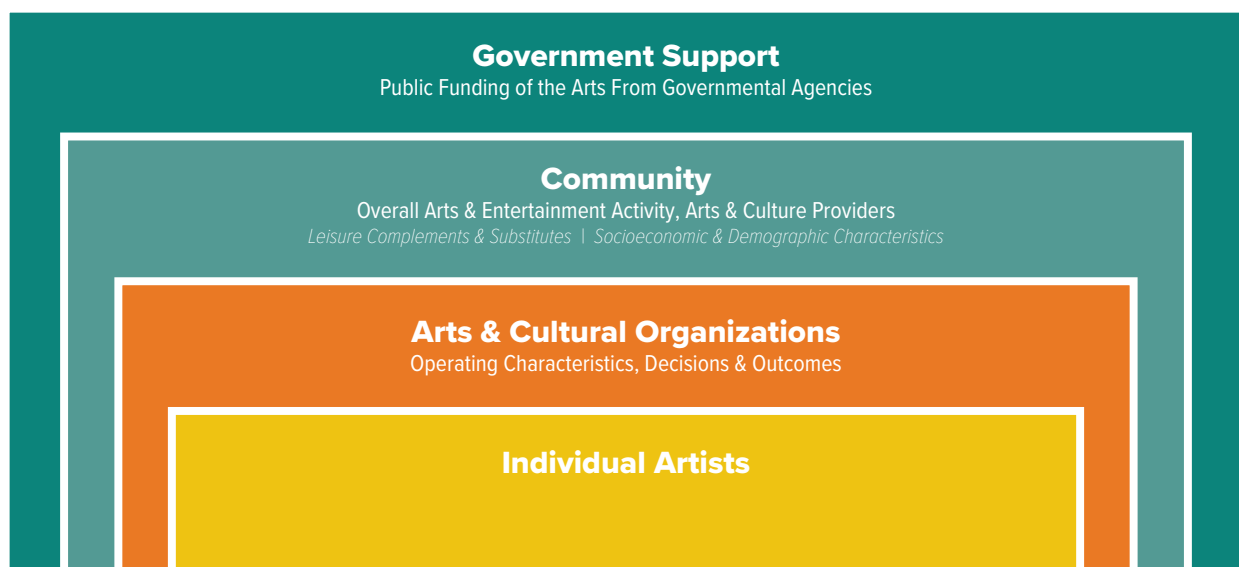
Figure 2: Modeling the Arts & Culture Ecosystem

We drew our measures from a review of the existing literature on arts and culture indicators and from our Model of the Arts & Culture Ecosystem (see Figure 2), which features a complex and interdependent set of relationships among: 1) artists and arts organizations; 2) their communities; and 3) government funding that influences the production and consumption of arts and culture.