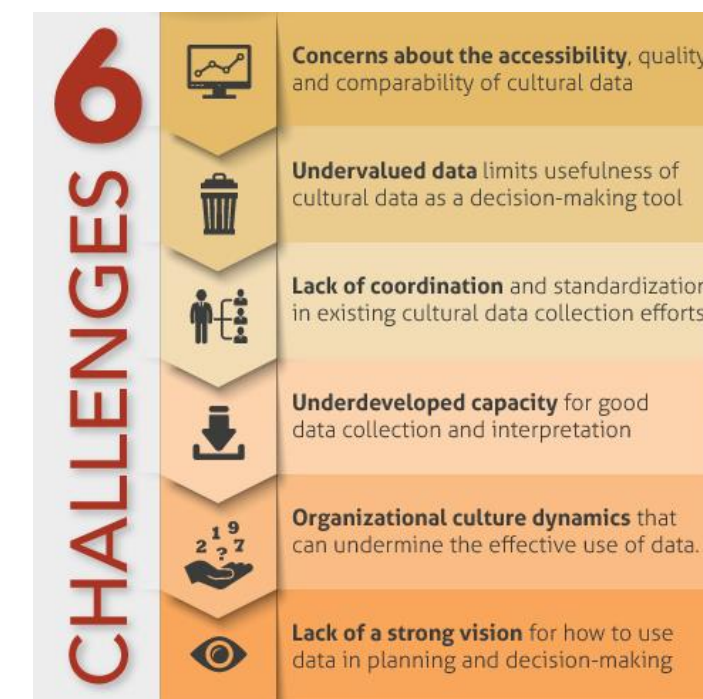
Figure 1. The six challenges identified in “New Data Directions” (2013)

In the summer of 2013, the Cultural Data Project (CDP) partnered with Slover Linett Audience Research to engage a group of leading researchers from academia and the consulting world in a virtual dialogue about cultural data and its role in supporting the long-term health, sustainability, and effectiveness of the cultural sector. The resulting white paper which was published in December 2013, New Data Directions for the Cultural Landscape: Toward a Better-Informed, Stronger Sector , identified six key challenges—three at the system-wide level, three at the organizational level—that appear to be inhibiting the field from more strategically and effectively engaging in data-informed decision-making practices (Figure 1).