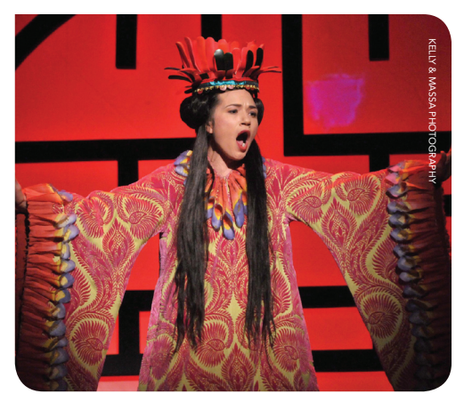
Opera Company of Philadelphia

An overview of the economic impact of arts and cultural organizations in the greater Los Angeles area, by the Los Angeles County Municipal Arts Funders.